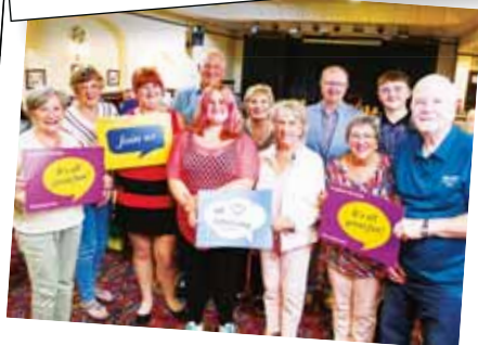
Brighouse and Huddersfield Oddfellows