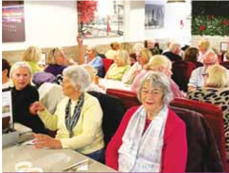
Fish and Chips Supper.