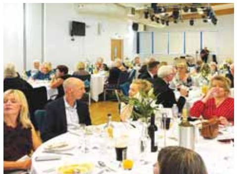
Annual Celebration Dinner Dance.