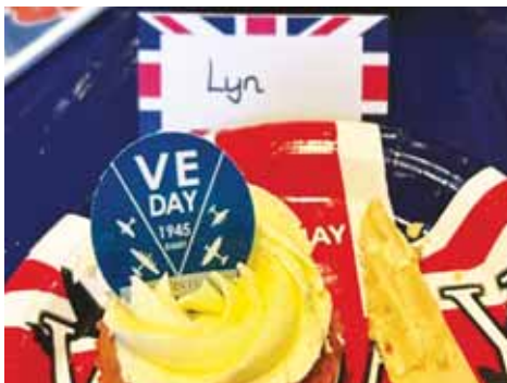
VE Day Evening Tea.