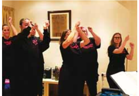
Macmillan Coffee Evening with Fleet Generation Signing Choir.