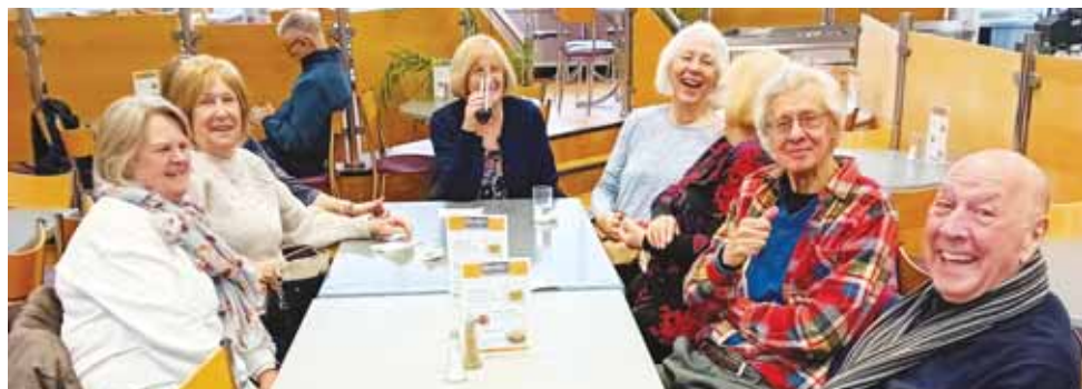
Some very sociable lunches out with the Chelmsford Branch.