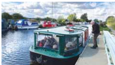
A day on the Canal – Papermill Lock/Heybridge Basin.

Day trips and evenings out are much appreciated and well attended by the group, we have had fun together at the