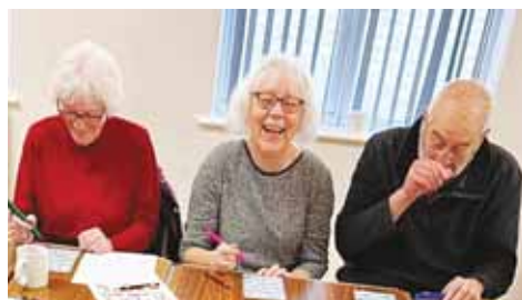
Bingo with a Twist provided much entertainment and fun at one our Chelmsford Branch monthly meetings.