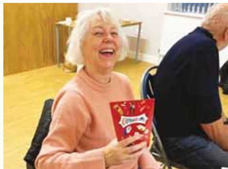
A very happy winner at our newly relaunched Chelmsford Branch!