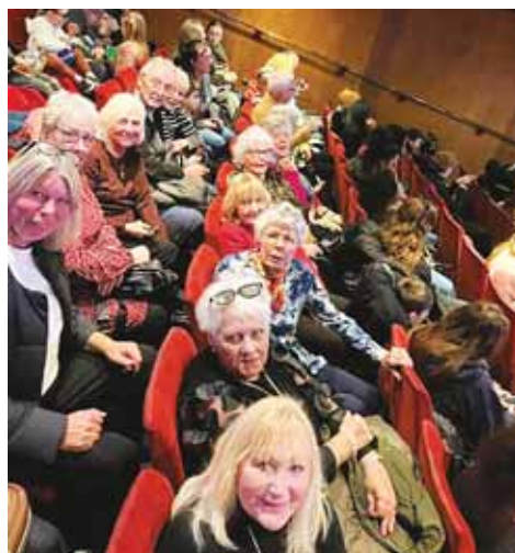
Christmas Pantomime – Jack and The Beanstalk – Cliffs Pavillion.