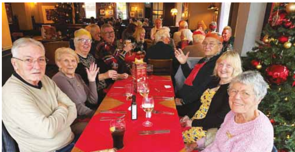
Christmas dinner together, Anne Boleyn Southend.