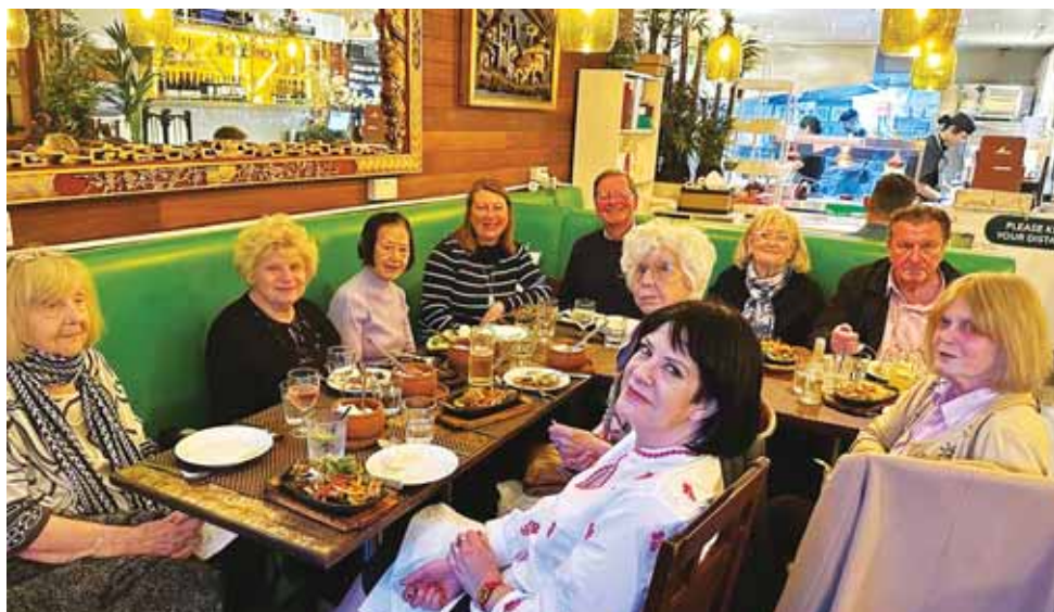
We had a lovely Vietnamese meal in Shepherd's Bush.