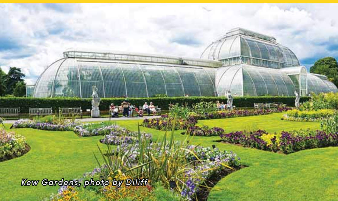
Kew Gardens