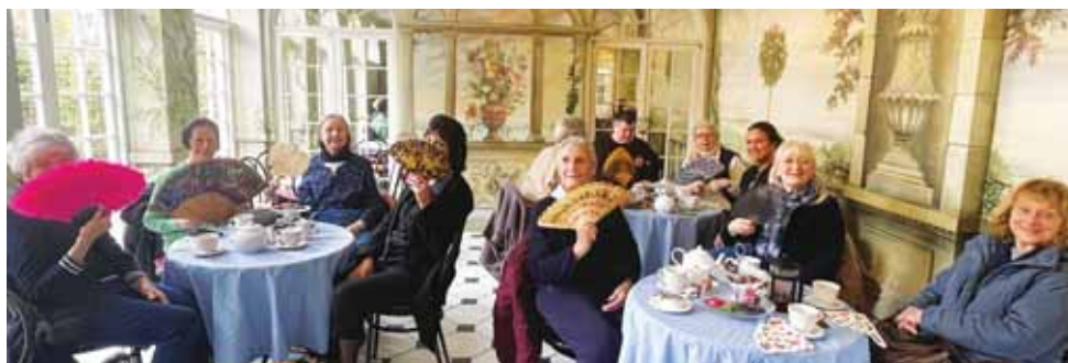
Fascinating fans at The Fan Museum in Greenwich.