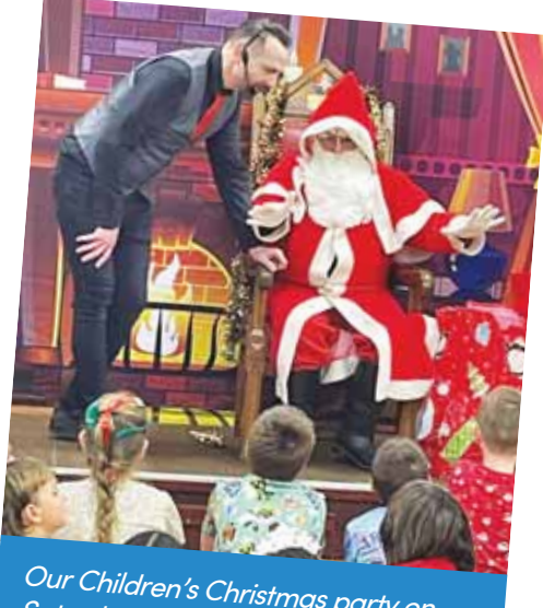
Our Children's Christmas party on Saturday 7 December proved a great success. 27 children, attended and £73 was raised with a charity raffle.