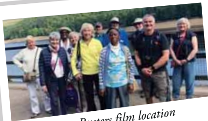
Dam Busters film location – Derwent Dam.