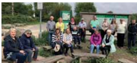
Walking in great company - Nottingham Trent Branch