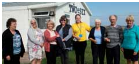
Bringing folk together on the Isle of Mona - Ormskirk and Southport Branch