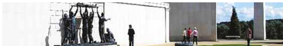
National Memorial Arboretum, Staffordshire