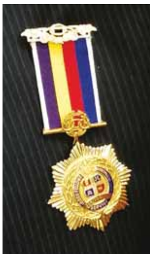
Meritorious Service Jewel.