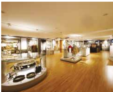
View of the Living in North Herts Gallery at the North Hertfordshire Museum. Image licensed under CC BY-SA 4.0. File: Living in North Herts Gallery.JPG. Photo by user: geni

Join friends and members at the North Herts Museum Café, followed by a walk around the museum if you wish. No need to book, just turn up. North Hertfordshire Museum, Brand Street, Hitchin, Herts SG5 1JE. Contact Sam on 07984 530287.