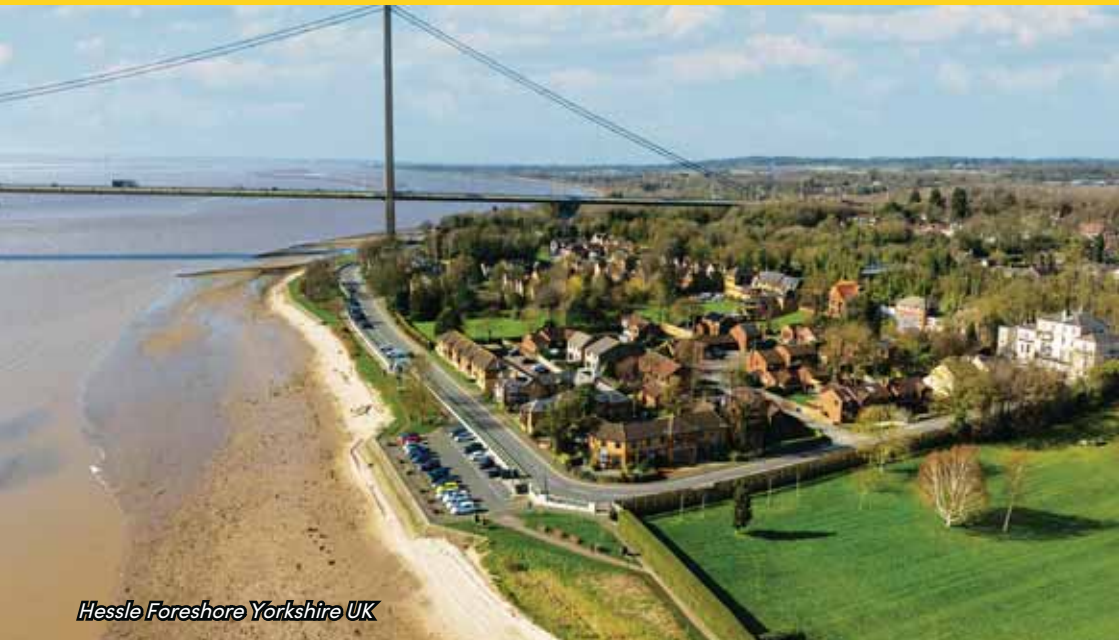
Hessle Foreshore Yorkshire UK