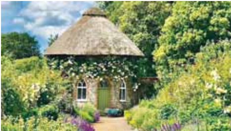
Little hut in West Dean.