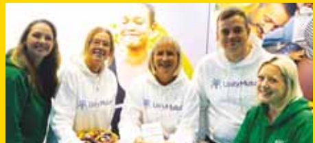
Unity Mutual at the Baby and Toddler show

The Junior ISA (JISA), offered in partnership with Mini First Aid to include a free paediatric first aid course*, turned heads, especially when parents realised once they'd set it up, anyone could contribute.