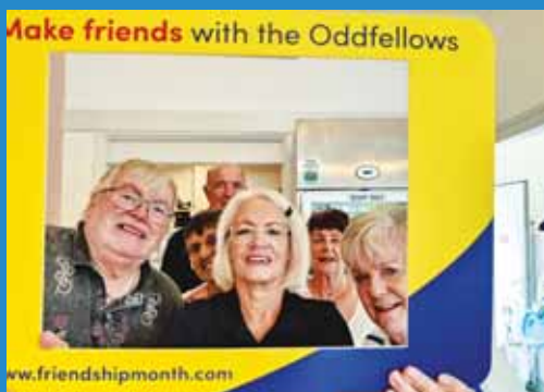
Little London Tea Shop in Pagham.

Following the success of our coffee morning in Pagham during Friendship Month last September, starting on Tuesday 27 February we will be holding a monthly coffee morning at The Little London Tea Shop in Pagham, 188 Pagham Road, Pagham, West Sussex PO21 3QB from 10.30am. This will be held on the fourth Tuesday of each month. Friends welcome. Contact Lynne on 01243 265360.