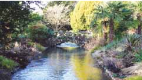
West Dean Gardens.