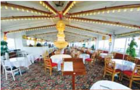
Victorian Tea Room at Eastbourne Pier.