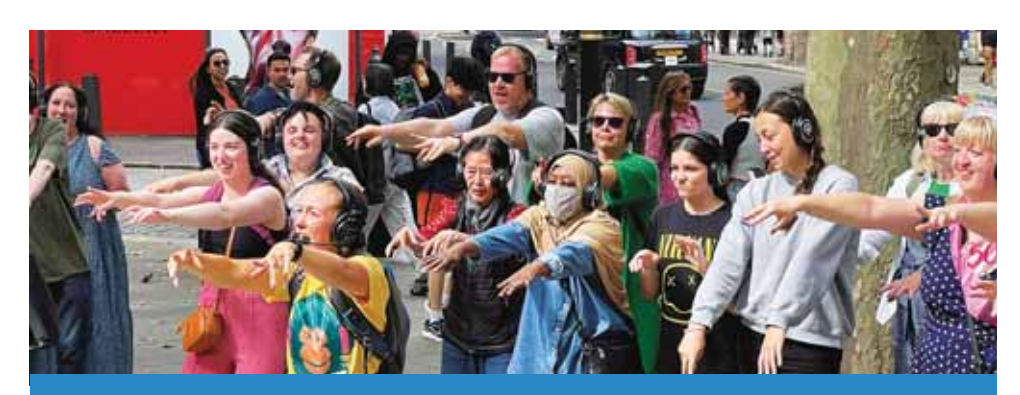
Disco walking tour