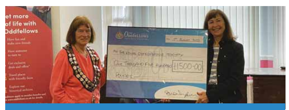
The Royal Osteoporosis Society