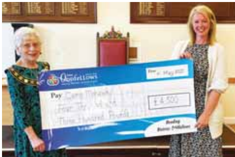
Reading Oddfellows donated £4,300 to Camp Mohawk

Oddfellows branches and members are avid fundraisers. In 2025, more than £148,000 was handed over to a huge range of wonderful causes throughout the country.