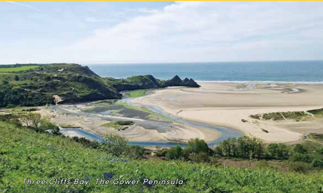
Three Cliffs Bay, The Gower Peninsula