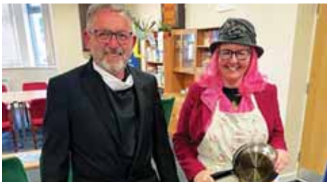
More hi-jinx at our film club 'Keeping Mum'.

Thank you to all who supported the events and made the last five months full of friendship and fun. Here's to the next six months!