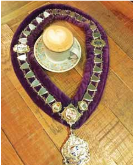
Members being shown the Provincial Grand Master's Chain of Office before restoration.