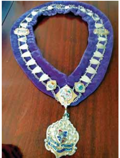
The Provincial Grand Master's Chain of Office is repaired and restored.