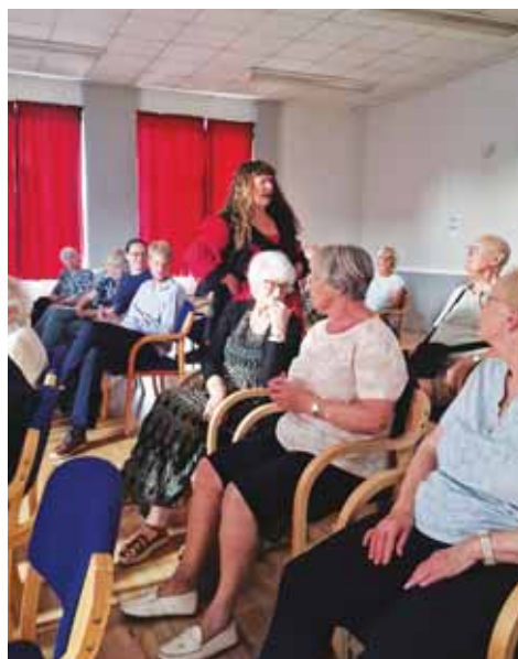
Talk on Charles Dickens.