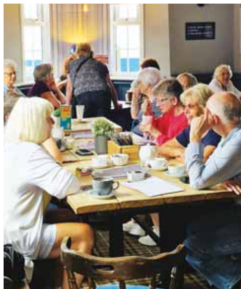
Coffee morning at the Wildfowler Terrington St Clements.