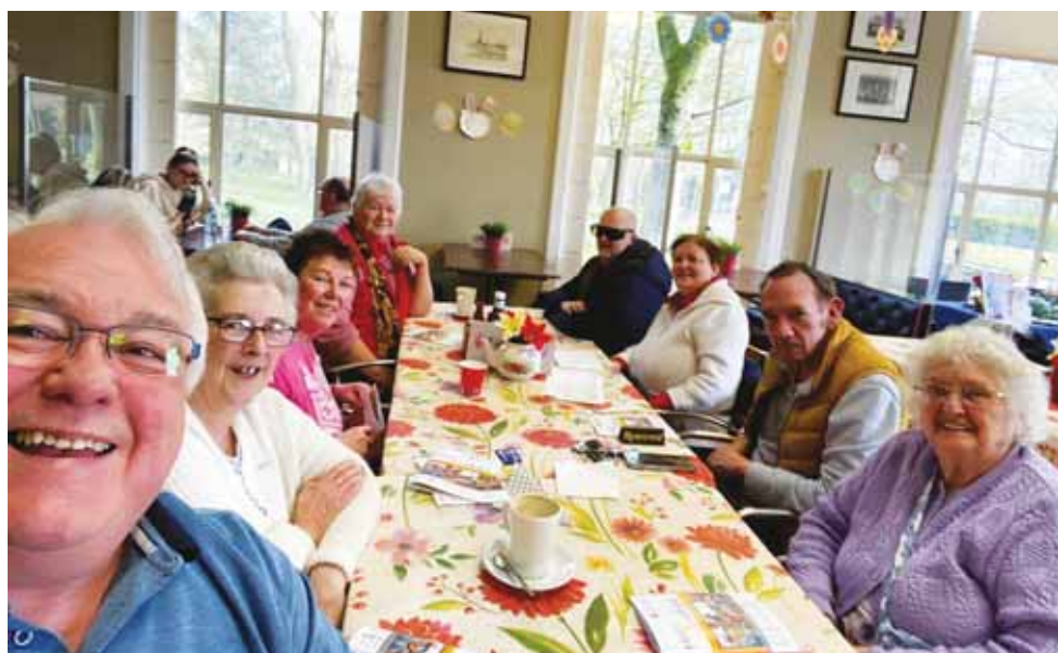
Lunch at Art Deco.