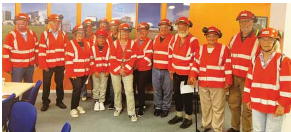
Heysham Power Station.