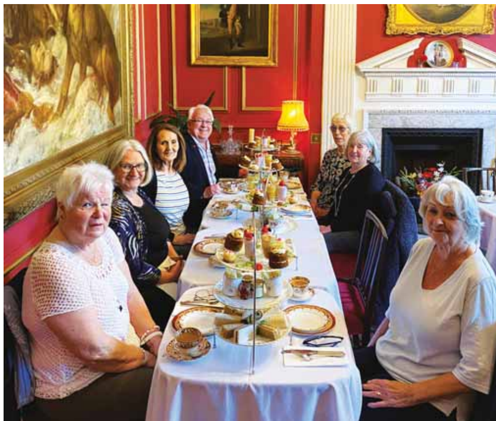
Lytham Hall afternoon tea.