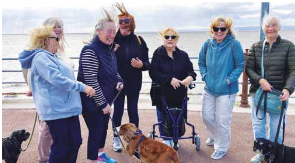
Windy Walk on the Promenade.