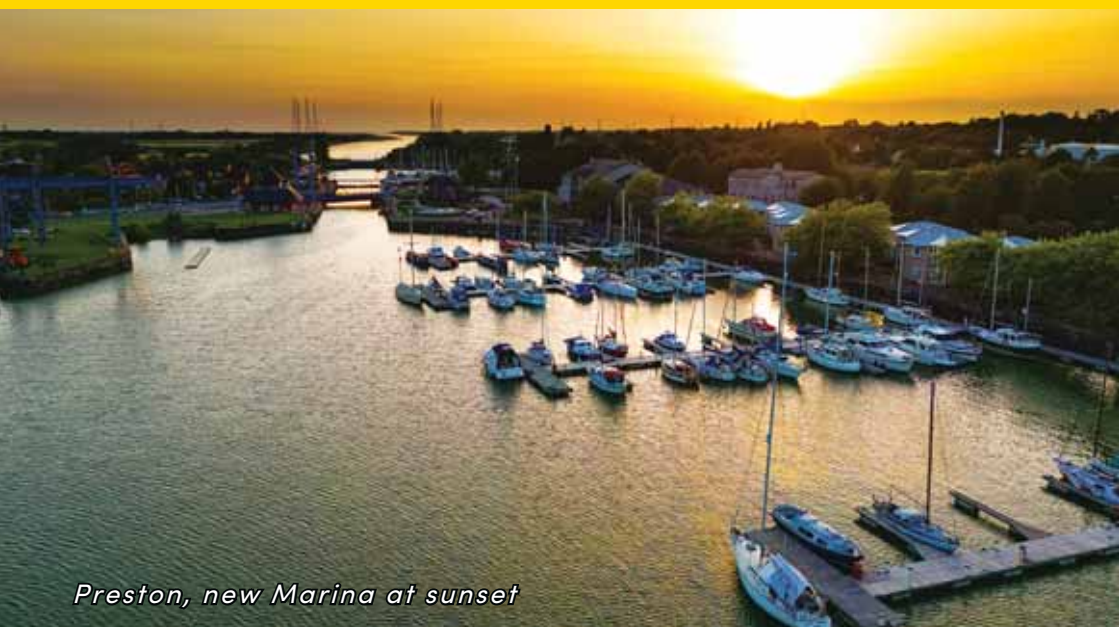
Preston, new Marina at sunset

Making Friends in Preston, Fylde and Lancaster