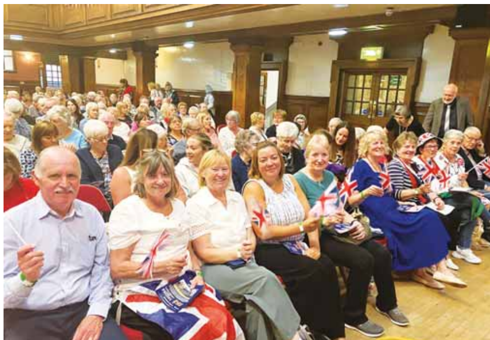
Last Night of the Proms.