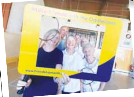
A friendly game of badminton in Mid-Surrey.