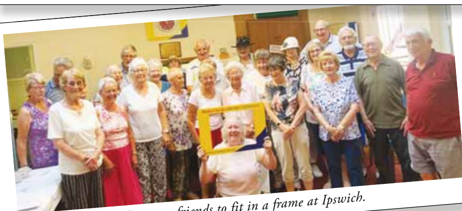
Too many friends to fit in a frame at Ipswich.