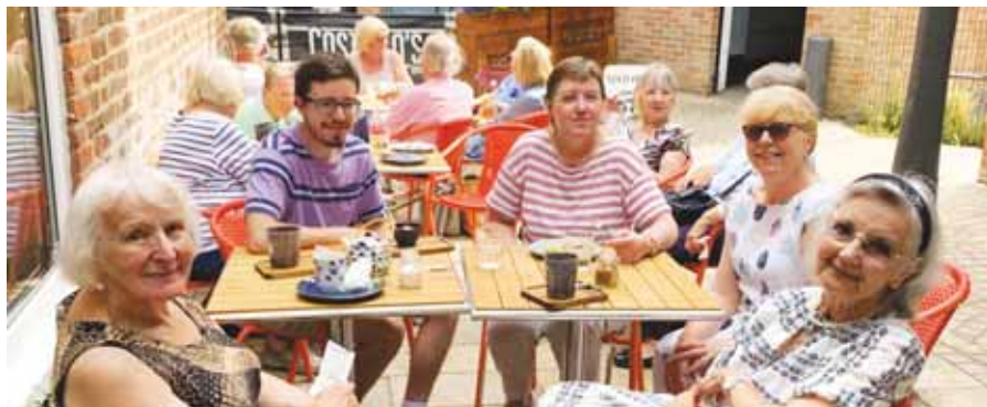
Delicious pancakes at a Handforth and Altrincham event.