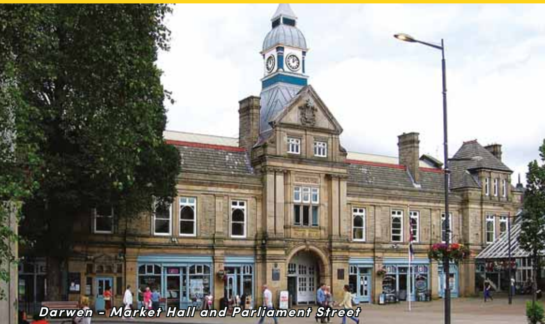
Darwen - Market Hall and Parliament Street