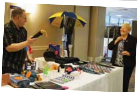
An array of Oddfellows merchandise was available for members to purchase

These include the Ken Hughes Silver Salver Award, won this year by Pride of Woolwich Branch, and the Lillian Ogden Recruitment trophy, awarded to Ormskirk and Southport Branch. Members can help their Branches to win awards too, as we also present the Refer a Friend Awards, to recognise Branches which have a great network of strong member advocates.