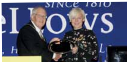
The "Refer a Friend" Award for the highest number of member advocates was awarded to Ormskirk and Southport Branch, with 31 members recruiting a new member in 2018