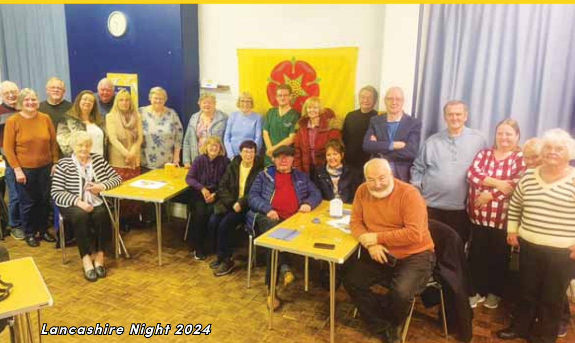
Lancashire Night 2024