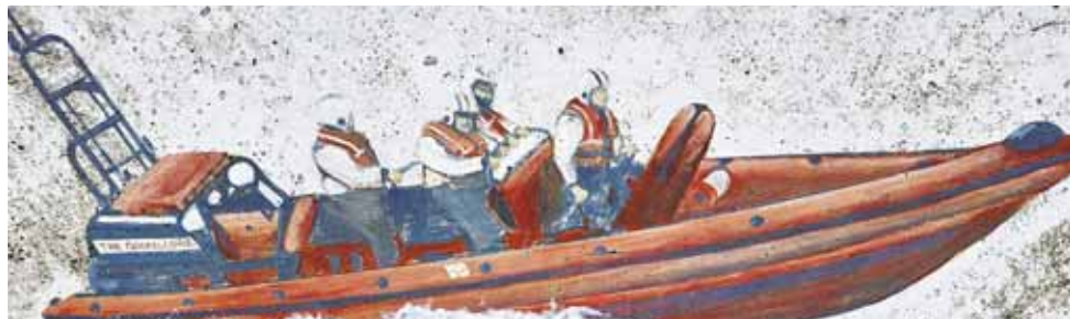
Photo of a coastal wall mural at Sheringham.

off launch and recovery carriage and £147,000 for the amphibious tractor.