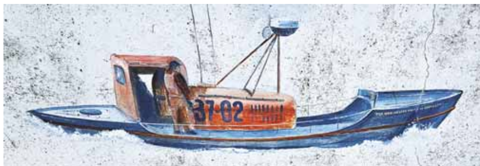
Photo of a coastal wall mural at Sheringham taken by member Neil Chatterton.

The cost of this third vessel was £135,000. The Oddfellows also raised £68,000 for the required new drive-on, drive-