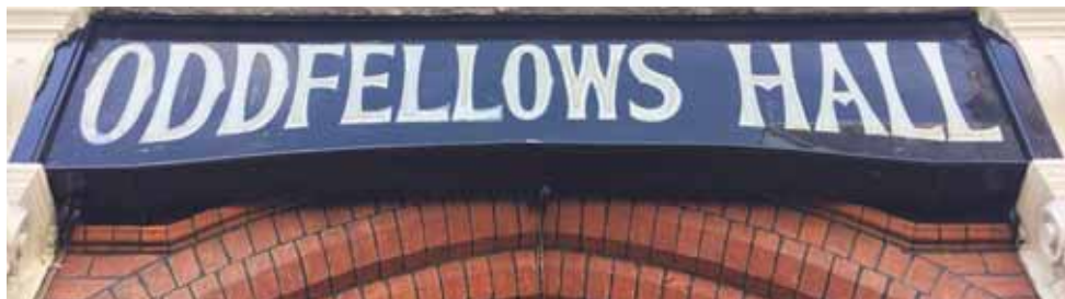
Oddfellows Hall Dorking