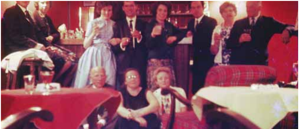
Oddfellows Holiday 1963