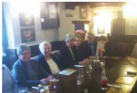
Enjoying Lunch in Leatherhead

Mid-Surrey District were joined by members of the West London District on Friday 6 April for a celebration lunch before the purple degree ceremony.