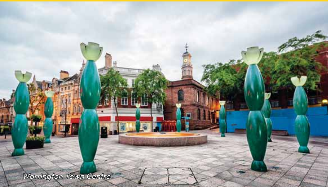
Warrington Town Centre