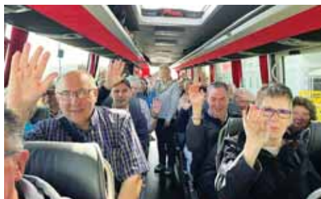
Oddies on the coach to Portmeirion

As well as business, attendees enjoyed a range of social activities, with Oddfellows Brass putting on another wonderful performance.