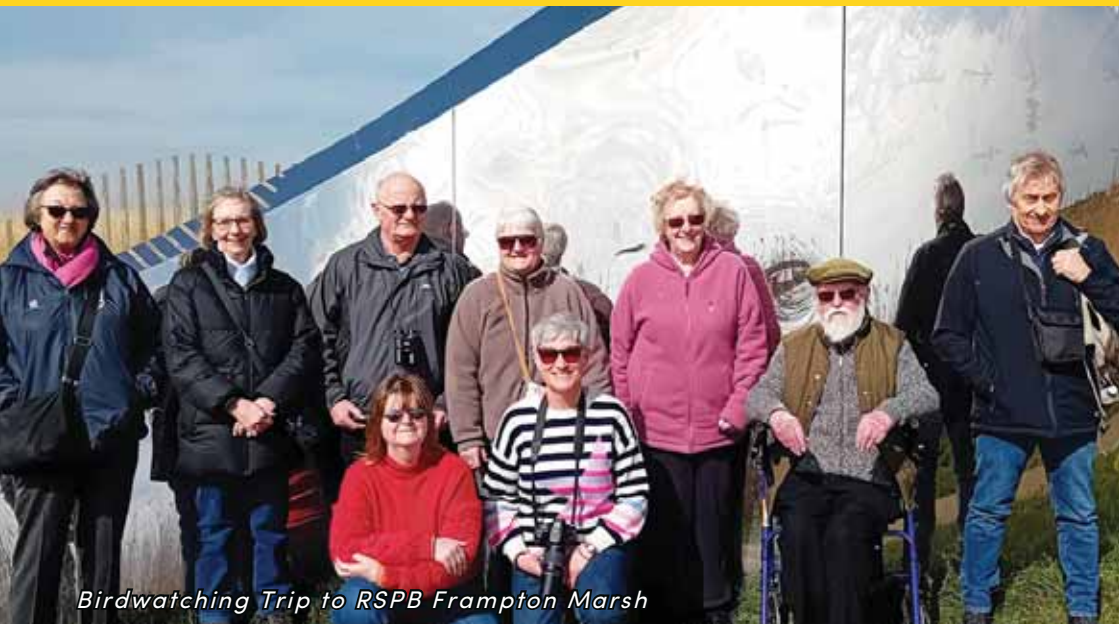
Birdwatching Trip to RSPB Frampton Marsh