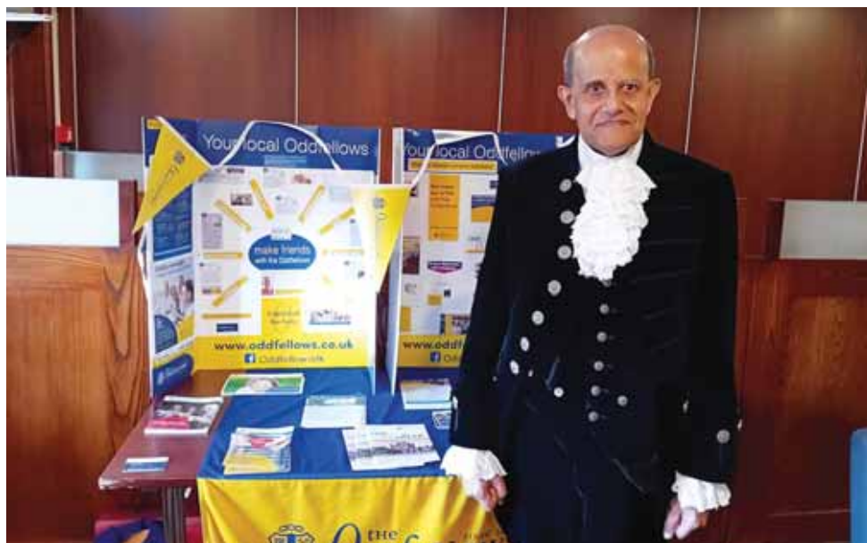
A visit from the High Sheriff of Cambridgeshire to our Outwell coffee morning