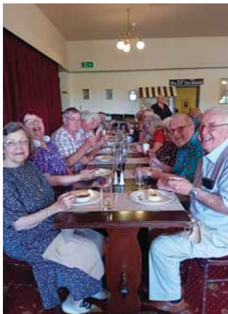
Senior lunch at Thorney