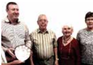
Inter District Quiz Final