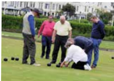
Oddfellows members enjoyed the annual bowls competition

With a jam-packed schedule mixing business with pleasure, AMC is a great opportunity for members to learn about the business side of the Society and our traditions, as well as meet and mingle with other Branches.