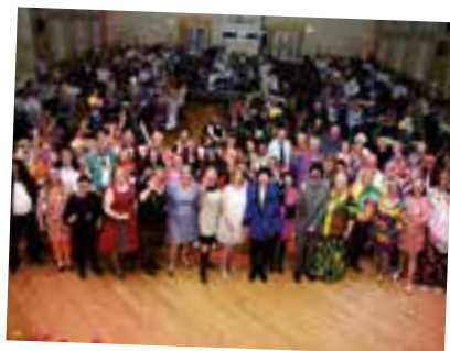
A 60s themed dance kicked off the celebrations at the Grand Master's Welcome Party