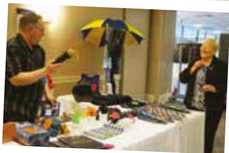
An array of Oddfellows merchandise was available for members to purchase

These include the Ken Hughes Silver Salver Award, won this year by Pride of Woolwich Branch, and the Lillian Ogden Recruitment trophy, awarded to Ormskirk and Southport Branch. Members can help their Branches to win awards too, as we also present the Refer a Friend Awards, to recognise Branches which have a great network of strong member advocates.