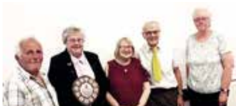
Third Place Vale of York