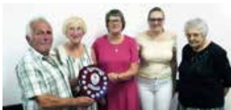
First Place Leeds

Throughout the year, teams from Bradford, Halifax, Huddersfield, Leeds and Vale of York have participated in the quiz nights, culminating in the top three teams attending the finals, Huddersfield, Leeds and Vale of York.