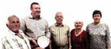
Second Place Huddersfield