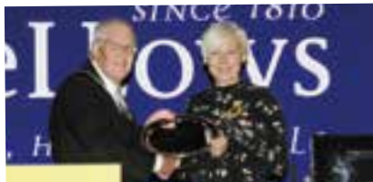
The "Refer a Friend" Award for the highest number of member advocates was awarded to Ormskirk and Southport Branch, with 31 members recruiting a new member in 2018