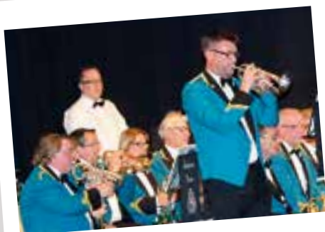
Oddfellows Brass gave a rousing public performance on Sunday