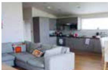
The Principle Trust