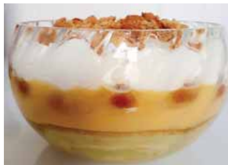
Platinum Jubilee pudding for Jubilee Garden Party.