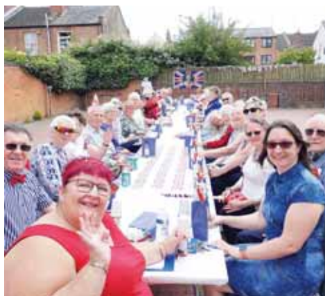
Members of Heart of England at Jubilee Garden Party.