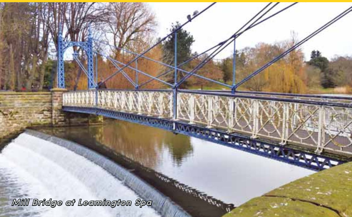
Mill Bridge at Leamington Spa