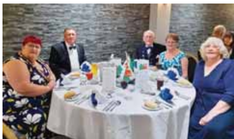
Members of Heart of England at Midland Group Conference Dinner.