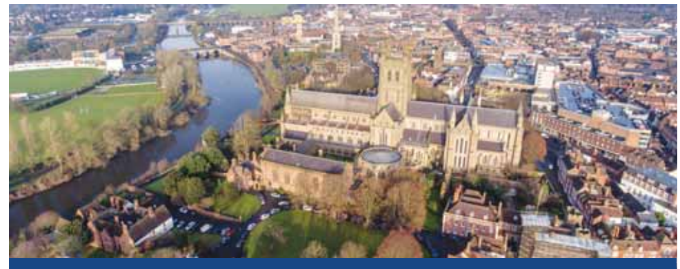
Join us for our city centre treasure trail - Monday 10 July

Welcome to the Spring edition of the Worcester District Oddfellows Events Diary and Newsletter.