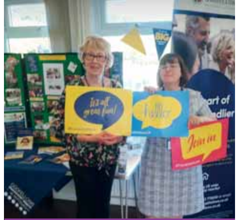
Friendship at its best