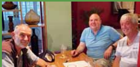
These three gentlemen were the winners on this particular evening

Our quiz evenings at the Deer's Leap have been great fun, with members and guests competing against each other for cash prizes. Meals have been enjoyed prior to testing our brains.