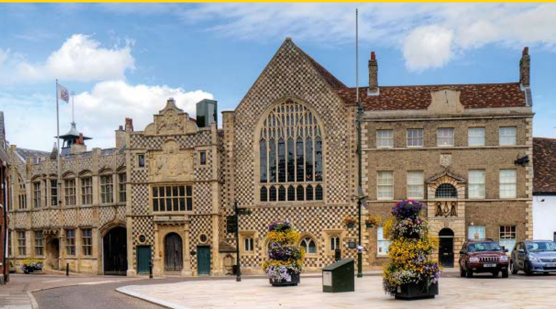
Kings Lynn Town Hall

Making friends across King's Lynn and West Norfolk