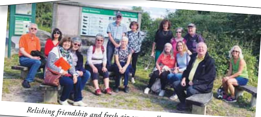
Relishing friendship and fresh air on a walk in Nottingham Trent.