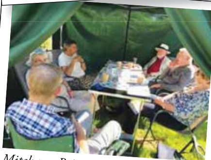
Mitcham, Reigate and Crawley friends keeping cool from the sunshine.