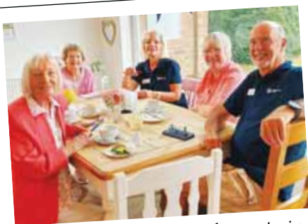
Brighton and Sussex members enjoying a coffee morning.

Take a look at some of the fun that's been had by some of our Branches!