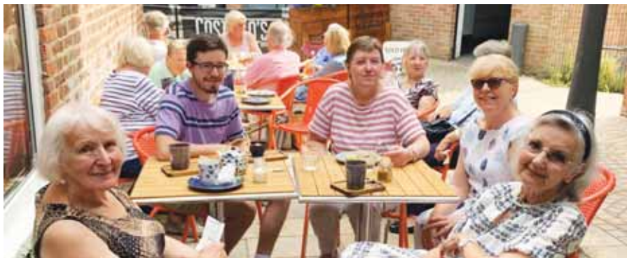
Delicious pancakes at a Handforth and Altrincham event.