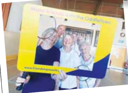
A friendly game of badminton in Mid-Surrey.