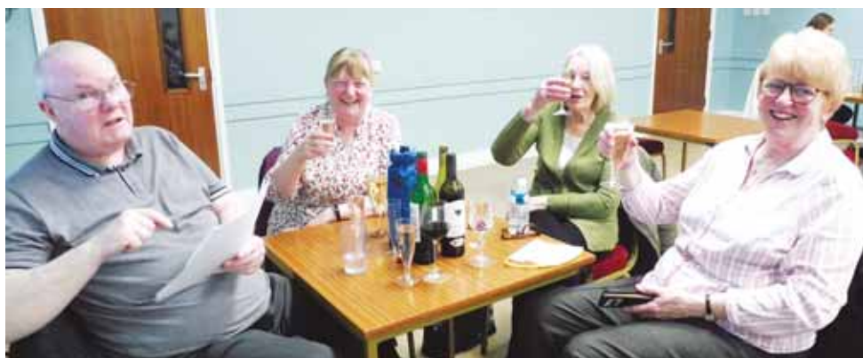
Winners of the quiz celebrating.