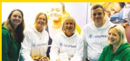
Unity Mutual at the Baby and Toddler show

The Junior ISA (JISA), offered in partnership with Mini First Aid to include a free paediatric first aid course*, turned heads, especially when parents realised once they'd set it up, anyone could contribute.