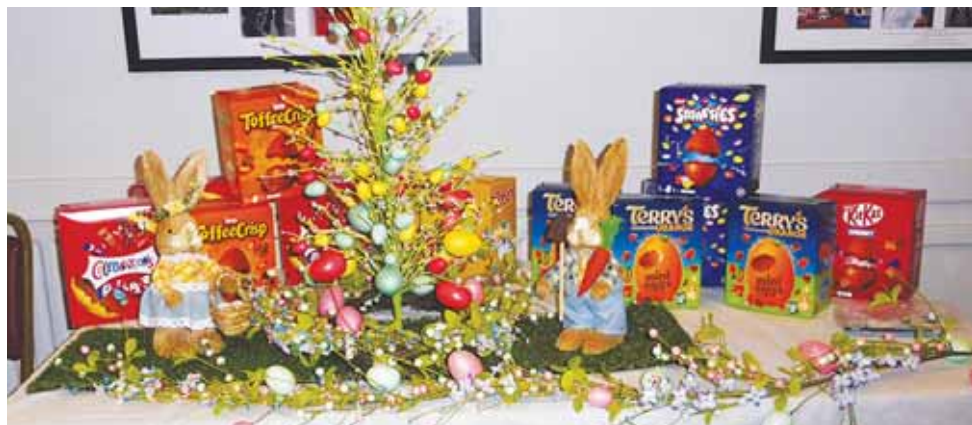
Prizes for the beetle drive winners.

This hugely popular event really needs no explanation. Lots of fun with the promise of Easter Eggs for prizes followed by pie/pea supper always results in the demand to repeat it all again as soon as possible.