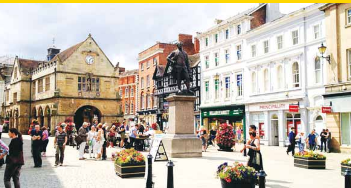
Photo of The Square, Shrewsbury

Covering Wem, Whitchurch, Malpas and Shrewsbury