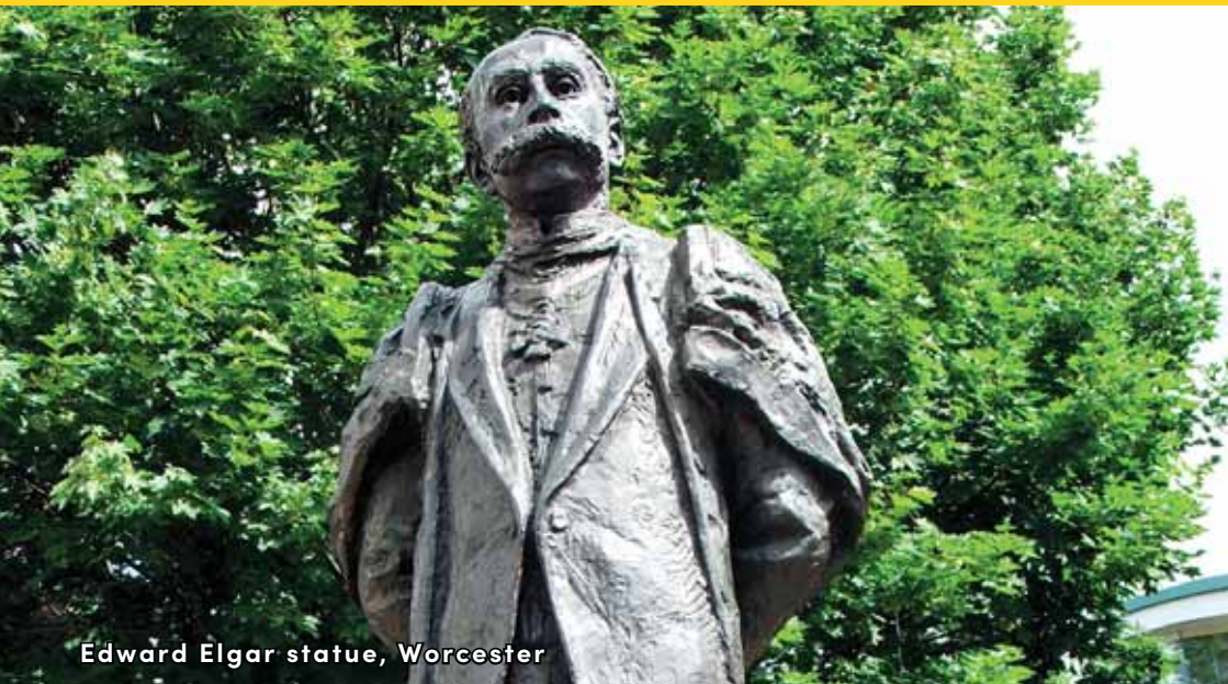
Edward Elgar statue, Worcester