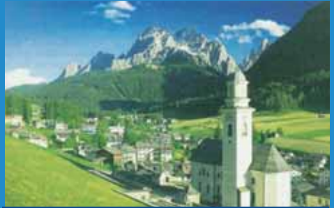
Village of Kaltern