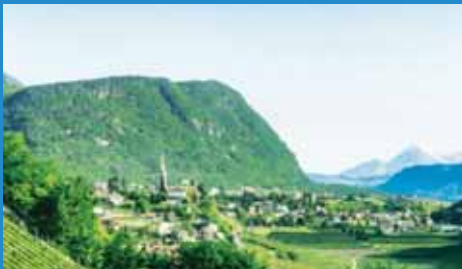
Village of Kaltern

You probably know that I was born in Italy and my family have a farm near Kaltern. I went to the UK to learn English and lived with a friend of my mother's in Uxbridge. While I was in the UK I trained and worked as a nurse, originally on the children's ward.