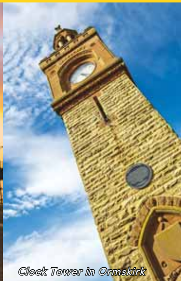
Clock Tower in Ormskirk