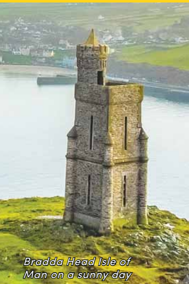
Bradda Head Isle of Man on a sunny day