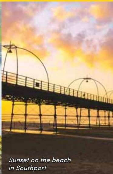
Sunset on the beach in Southport