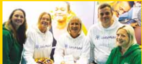
Unity Mutual at the Baby and Toddler show

The Junior ISA (JISA), offered in partnership with Mini First Aid to include a free paediatric first aid course*, turned heads, especially when parents realised once they'd set it up, anyone could contribute.