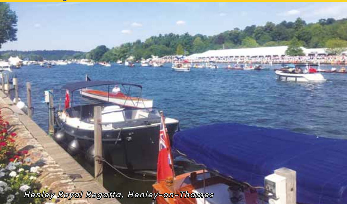
Henley Royal Regatta, Henley-on-Thames

Reading District (covering Reading, Maidenhead, Thatcham, Henley, Woodley, Pangbourne and Tilehurst)