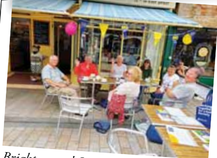
Brighton and Sussex Oddfellows enjoying a coffee morning