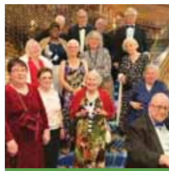
Dressed for dinner

"In the evenings there was varied entertainment in the main theatre but also music in the bars to suit all tastes. Of course, there was plenty to eat and drink too!"