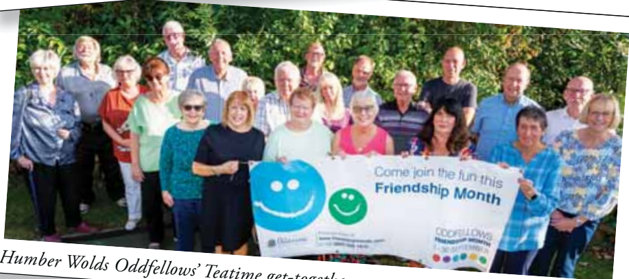
Humber Wolds Oddfellows' Teatime get-together