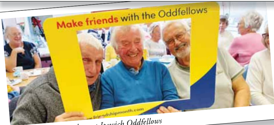
Friendship and laughter at Ipswich Oddfellows