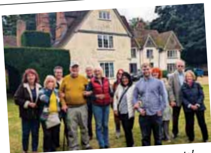
A day trip to Provender House with Canterbury Oddfellows

"Coffee mornings, walks, talks, music events, meals, games, quizzes, day trips – whatever it might be, you've pulled out all the stops to let the nation know that we're here and ready to offer support, fun and friendship to all."