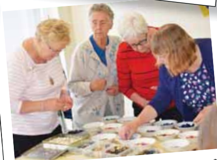
Bury St Edmunds Oddfellows getting crafty