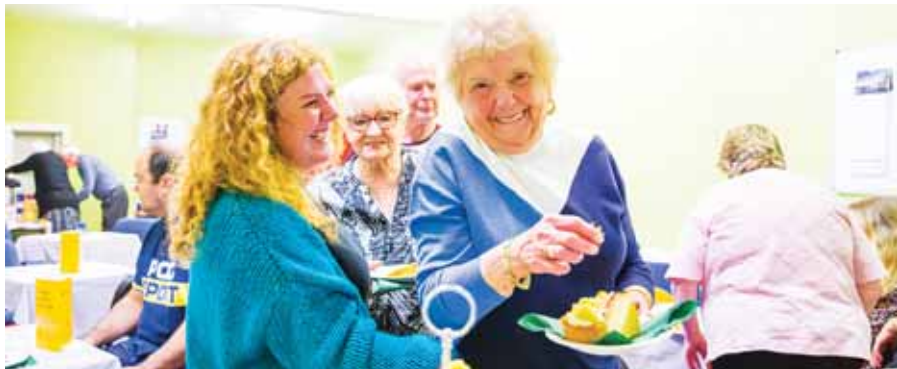
Cakes galore at Halifax Oddfellows