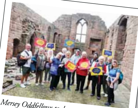
Mersey Oddfellows took a walk in Birkenhead