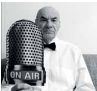
The newsreader announces the murder.