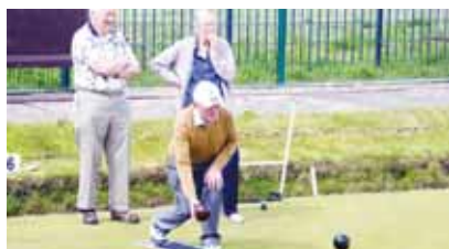
Members enjoyed the Roy Harmer Bowls Tournament.

Hosted by Brighton and Sussex Oddfellows, there were a number of social activities in the schedule too. Before business got underway, members and the public were treated to another fantastic performance by Oddfellows Brass – a high point for many each year. Other events held throughout the week included the black and white-themed welcome evening, a church service where remembrance wreaths were laid, a day trip to Rye, a bowls tournament, and the Farewell Dance.