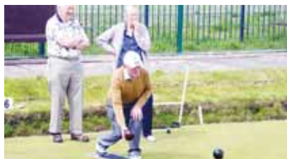
Members enjoyed the Roy Harmer Bowls Tournament.

Hosted by Brighton and Sussex Oddfellows, there were a number of social activities in the schedule too. Before business got underway, members and the public were treated to another fantastic performance by Oddfellows Brass – a high point for many each year. Other events held throughout the week included the black and white-themed welcome evening, a church service where remembrance wreaths were laid, a day trip to Rye, a bowls tournament, and the Farewell Dance.