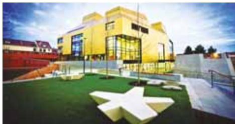
The Hive, Worcester.

On Monday 10 July several of our members spent the afternoon wandering around the city of Worcester trying to find answers to clues on a fantastic treasure trail.