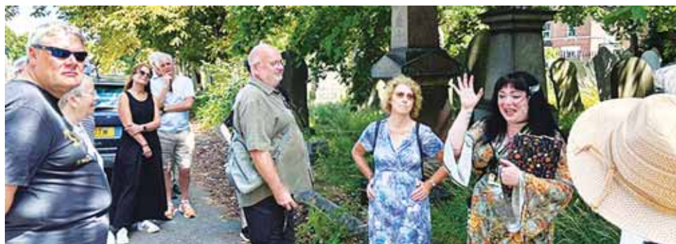
Members do love a cemetery! And we had a very interesting and enjoyable tour of the Nottingham Rock Cemetery recently.