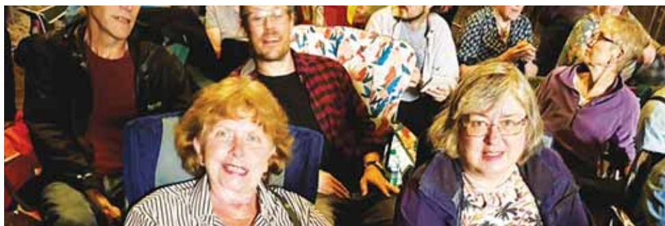
Members had a wonderful night in The Park Tunnel which has become famous for its fantastic acoustics. We were entertained by the fabulous Belters choir.