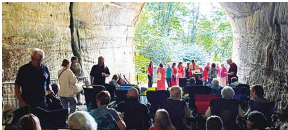
he fantastic Belters Choir singing in the Park Tunnel).