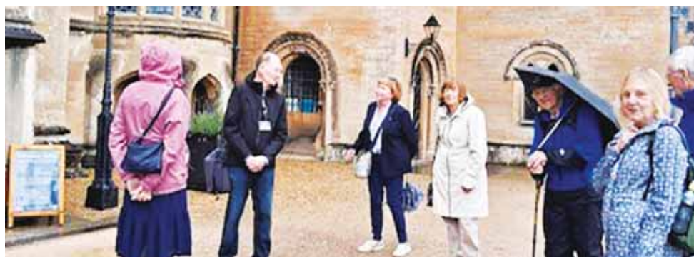
Members enjoying themselves at a rather wet Newstead Abbey.