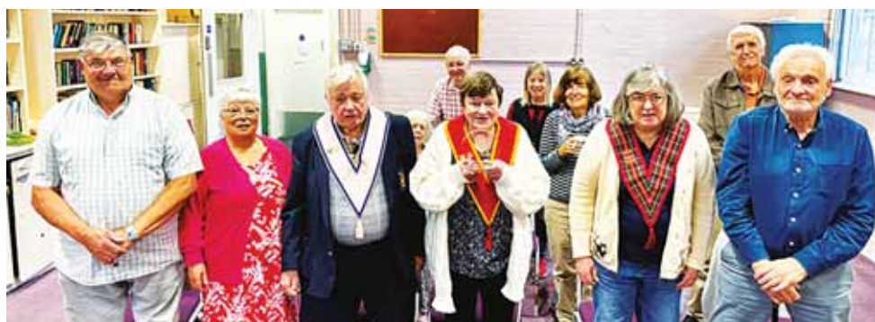
Come along to our Prince of Peace Social Meeting for friendship and fun.