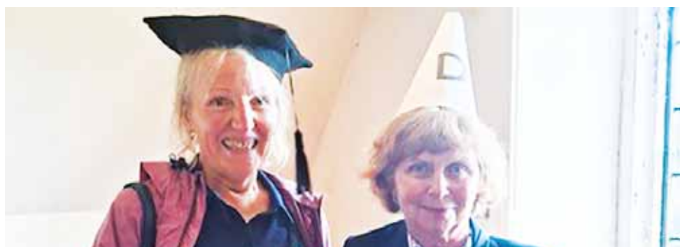
Members having fun at Newstead Abbey.