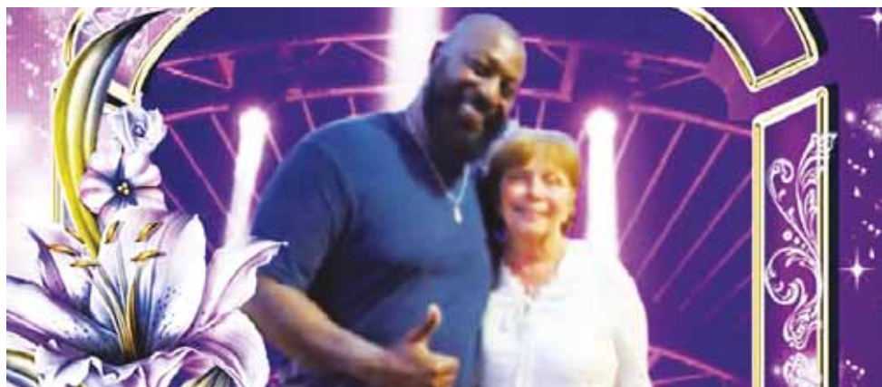
We had a wonderful time at the Drifters at Newark Palace Theatre. Some members were privileged to meet the performers after the show!