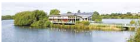
Friendship Walk at Attenborough Nature Reserve - Saturday 20 September

Recently, it became clear that not all membership areas were being covered,