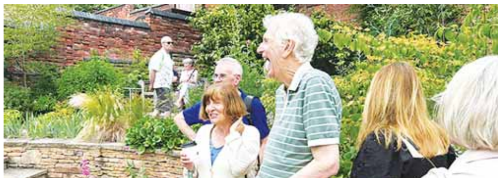
We had a fabulous day out at the bi-annual opening of the Nottingham Park Estate Gardens.