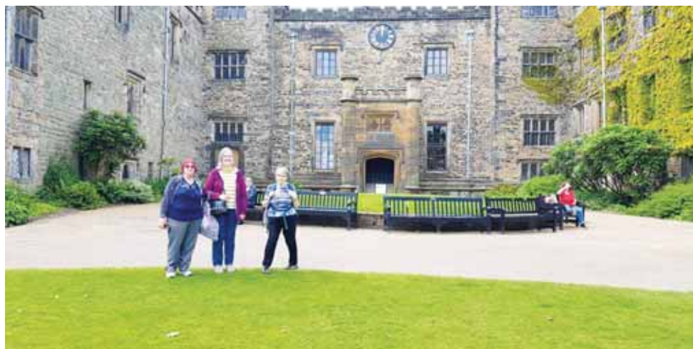
A visit to Towneley Hall and Park

were apart for so little time. They were remembered in the Vote of Condolence at the SEL Half Yearly Meeting on Saturday 29 October.