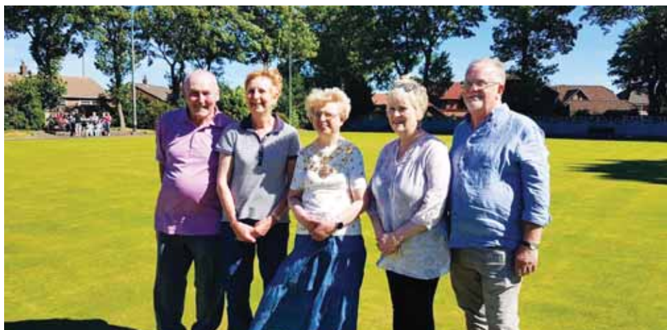
LADGC Bowling Competition