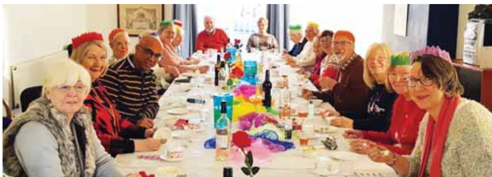
Christmas Lunch at Bury Oddfellows Hall