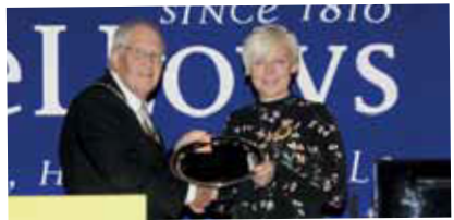
The “Refer a Friend” Award for the highest number of member advocates was awarded to Ormskirk and Southport Branch, with 31 members recruiting a new member in 2018