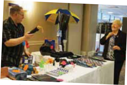
An array of Oddfellows merchandise was available for members to purchase

These include the Ken Hughes Silver Salver Award, won this year by Pride of Woolwich Branch, and the Lillian Ogden Recruitment trophy, awarded to Ormskirk and Southport Branch. Members can help their Branches to win awards too, as we also present the Refer a Friend Awards, to recognise Branches which have a great network of strong member advocates.