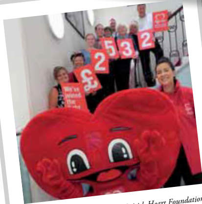
Oddfellows raise £2532 for the British Heart Foundation