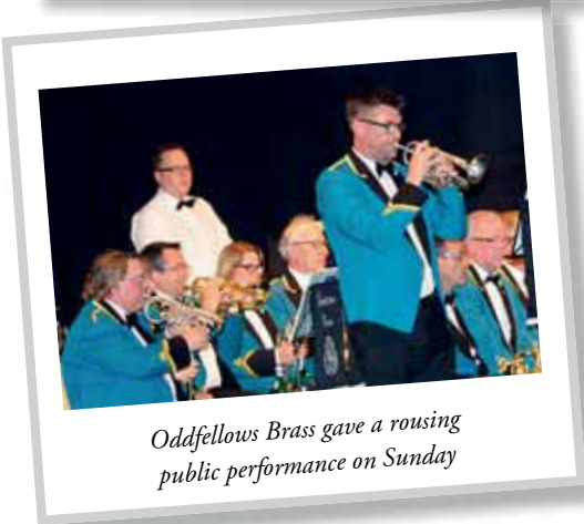
Oddfellows Brass gave a rousing public performance on Sunday