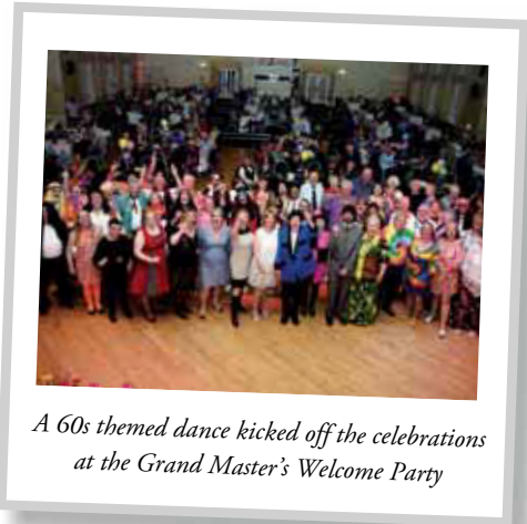
A 60s themed dance kicked off the celebrations at the Grand Master's Welcome Party