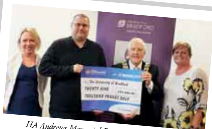
HA Andrews Memorial Fund presents University of Bradford with £29,000