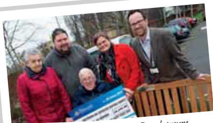
North Gloucestershire District Branch present Cheltenham hospital with £6,644.00.

Congratulations to everybody involved in any and all fundraising activities. Please continue to keep up the good work and dig deep wherever you can! If you can't spare a little bit of cash, maybe you could help in different ways? There's always a need for an extra pair of hands, whether you're rounding up the troops, baking some delicious goodies, or tidying up after an event – your time is just as valuable to charity fundraisers as any money you're able to donate.