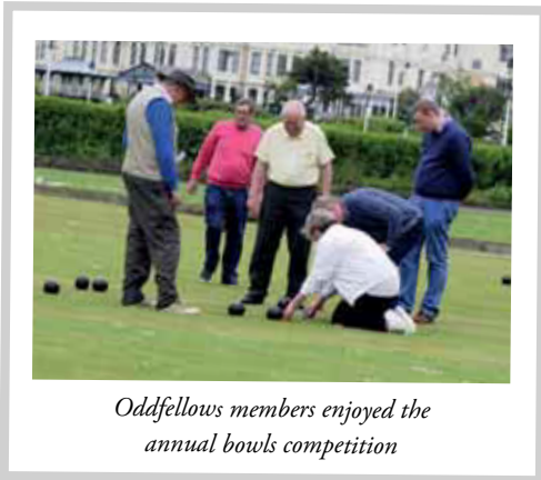
Oddfellows members enjoyed the annual bowls competition

With a jam-packed schedule mixing business with pleasure, AMC is a great opportunity for members to learn about the business side of the Society and our traditions, as well as meet and mingle with other Branches.