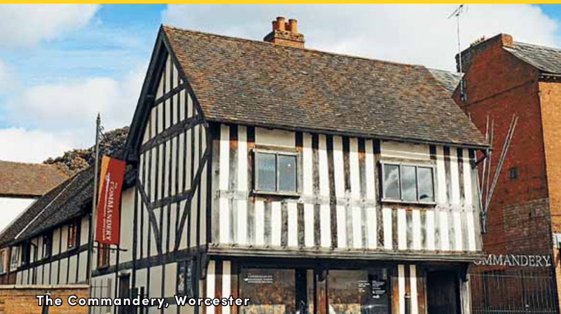
The Commandery, Worcester