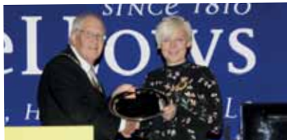
The "Refer a Friend" Award for the highest number of member advocates was awarded to Ormskirk and Southport Branch, with 31 members recruiting a new member in 2018