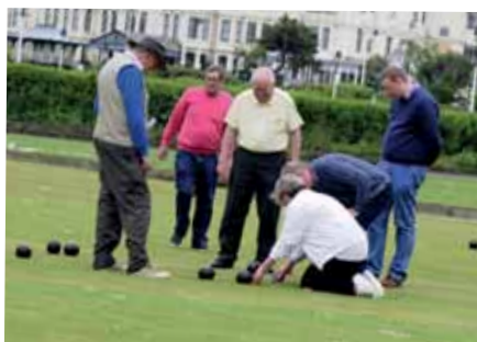
Oddfellows members enjoyed the annual bowls competition

With a jam-packed schedule mixing business with pleasure, AMC is a great opportunity for members to learn about the business side of the Society and our traditions, as well as meet and mingle with other Branches.