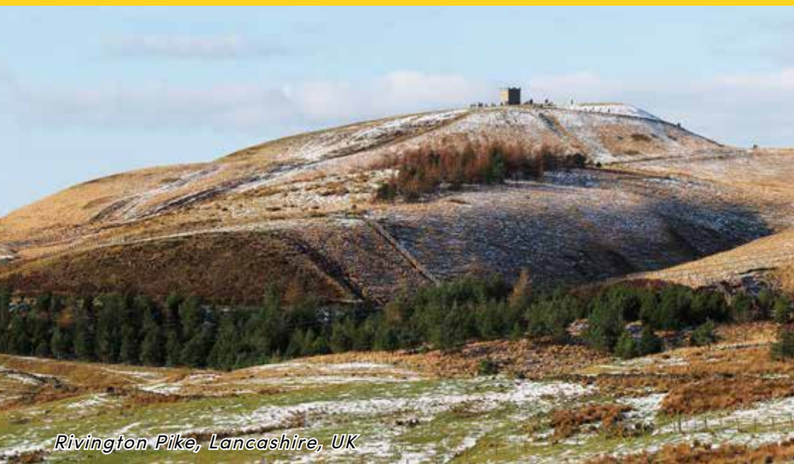
Rivington Pike, Lancashire, UK