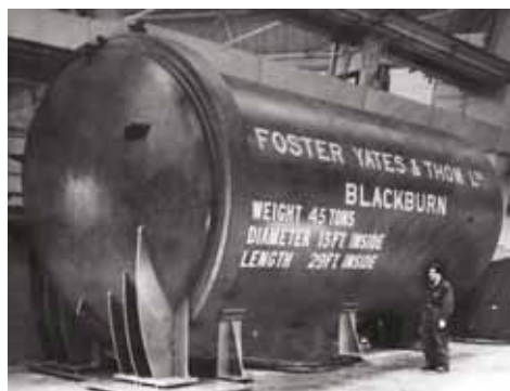
Dad about to inspect one of the jobs he worked on.

welders to work for longer periods without the handle getting hot, therefore, increasing production. He also patented a different type of wallpaper scraper – always the inventor! He worked on a piece of equipment that landed on the moon, also part of the first fast train and has always been very knowledgeable about all types of metals.