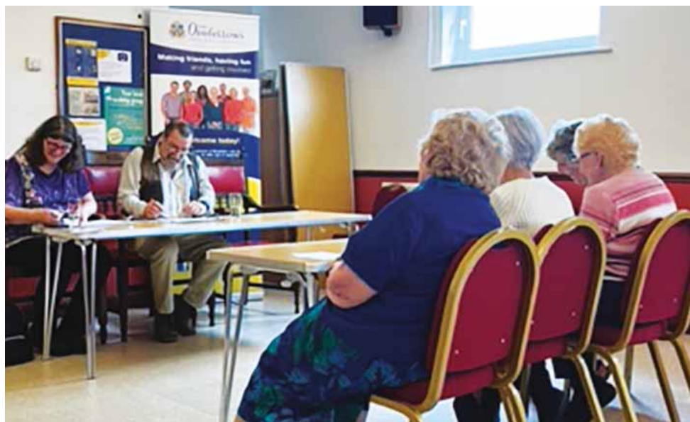
One of our quiz event.

join in the fun. If you are nervous about coming into a room of strangers give us a ring and we will meet you at the door and look after you.