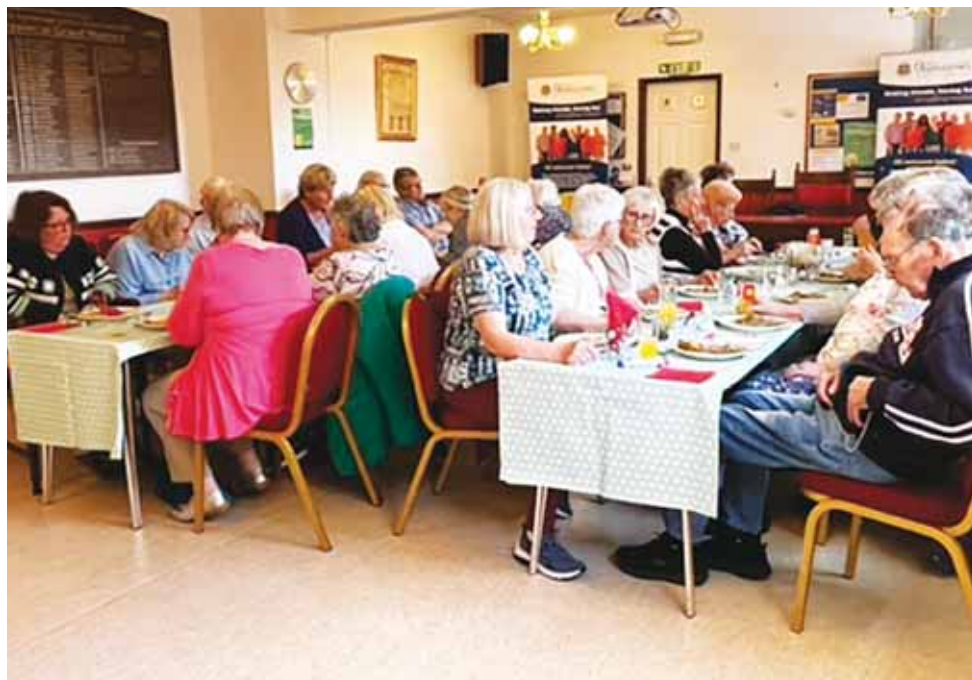
Pie and peas supper.

was won at the last time we met so will be starting all over again. Just a reminder the games of bingo are included in the meal cost and there are cash prizes on the two games we have.