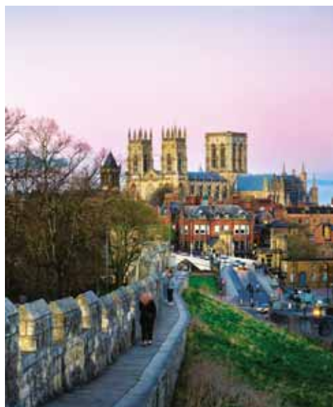
Oddie's Hikers - York City Walls Thursday 18 September

Welcome to the Vale of York District of the Oddfellows. Members of the District have organised an exciting and varied programme of events for everyone.