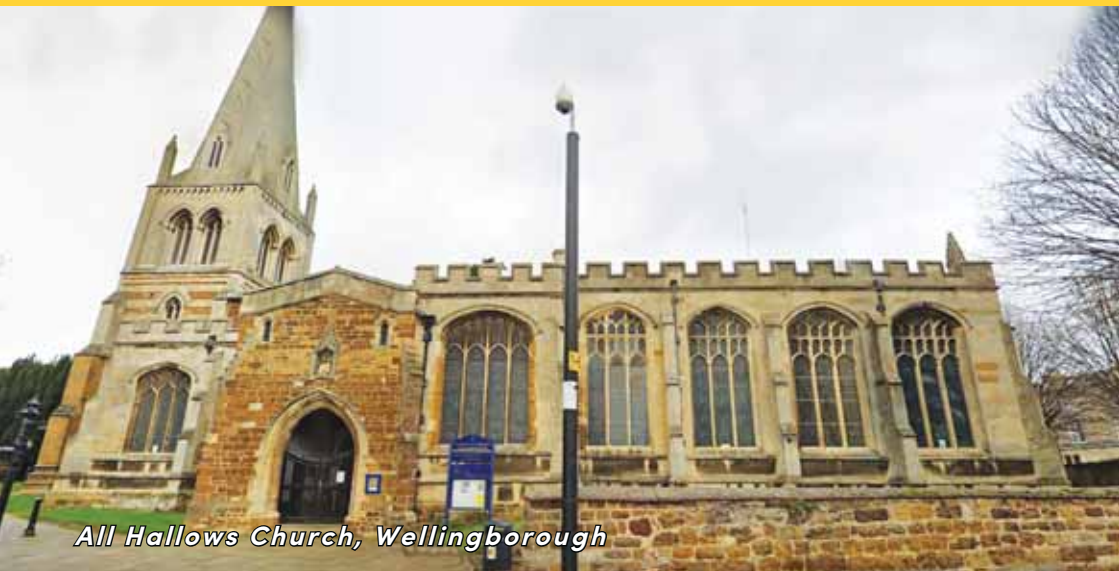
All Hallows Church, Wellingborough

Making friends across Beds and Bucks District