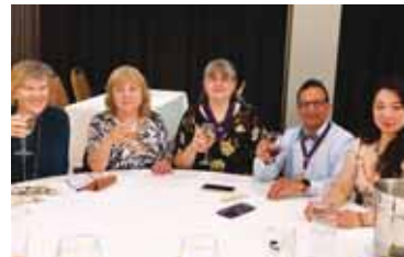
Annual Movable Conference (AMC 2025)