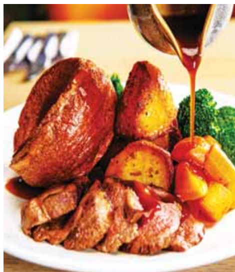
Sunday Lunch at La Farola Sunday 22 March 2026