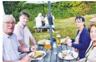
BBQ and Ritual