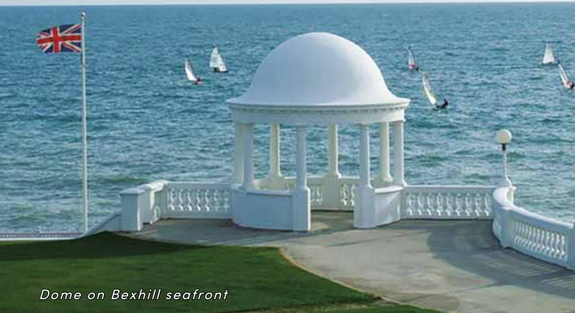
Dome on Bexhill seafront