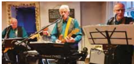
Side by Side.

Thirty members in May saw the return of Side By Side, one of our most popular, and danceable, bands. Once again they gave a great collection of well-known songs – Yesterday Man, Never Can Tell, Give Me Some Loving, Hey Baby, Hungry Heart, and so many more. Side By Side provided a grand evening for those that wanted to dance, sing along, or just listen, as they always do. Sadly this may be the last time we see them due to poor health.