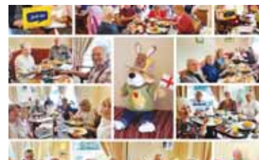
Friendship Lunchtime Get-Togethers