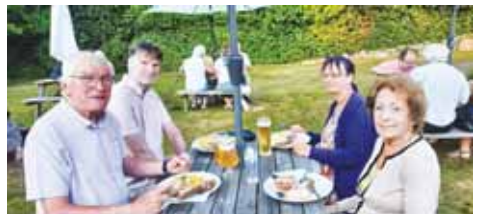
Members enjoying the BBQ.

In July, we held our second ritual lodge at the Constitutional Club in Tunbridge Wells since the pandemic. It was lovely to find so many members interested in the traditional side of Oddfellowship with eight members either being welcomed or taking either one or two of the degrees. Afterwards, they joined with other members at the club to enjoy a delicious BBQ. Twenty-nine members and a guest enjoyed a meal expertly prepared by the staff. A