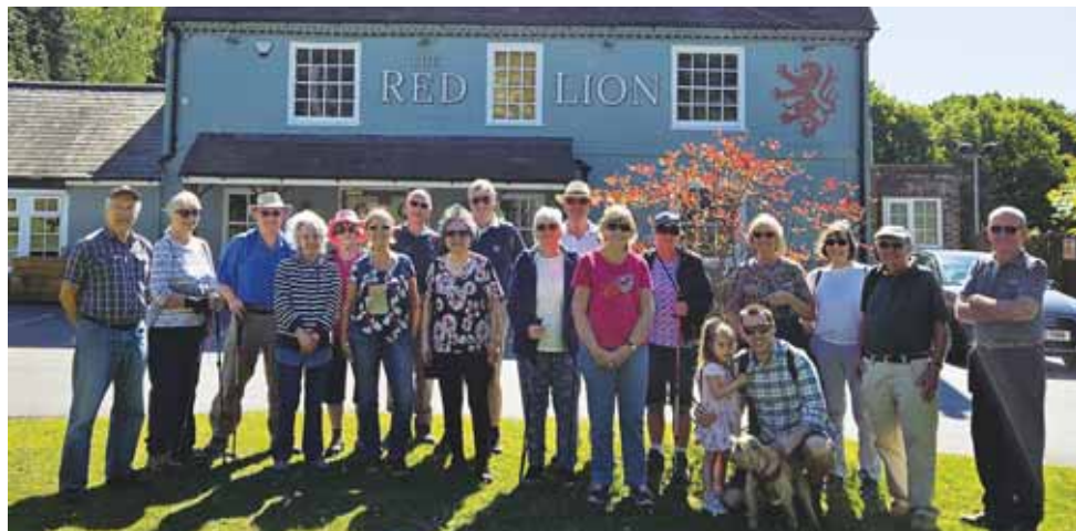
Chelwood Gate Ramblers.