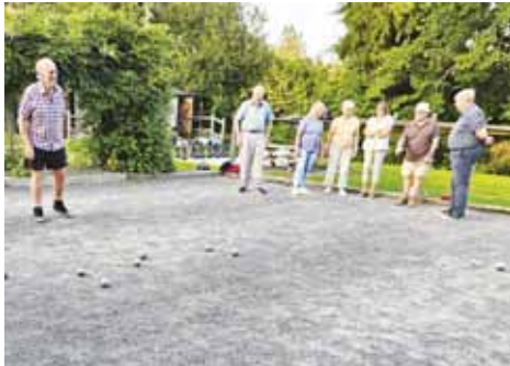
Members enjoying Pétanque.

Forty-eight members gathered on a pleasant evening in August for a competitive game of pétanque, although some members preferred to forego the exercise and just sit and chat while enjoying the fresh air. Playing in teams of four, participants quickly discovered that tossing a silver metal ball along a gravel pitch towards a fairly small target is not as easy as you'd think! Many balls fell short of the target, others sailed past to hit the backboard, while a few skewed off sideways onto the next rink! Never mind, it's the taking part that counts and all who did so enjoyed the game, regardless of whether their team won or lost.