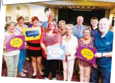
Brighouse and Huddersfield Oddfellows