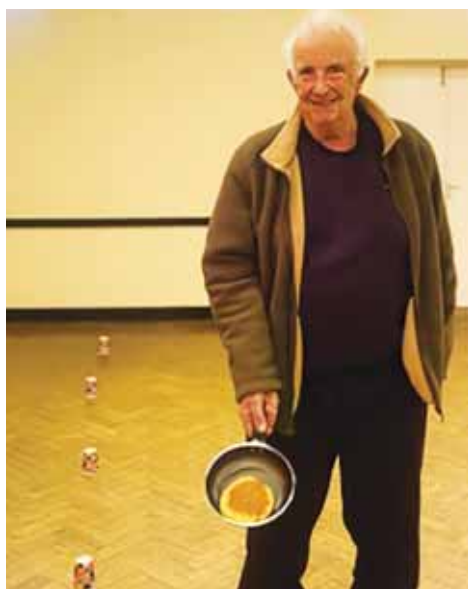
Pancake Day Event.