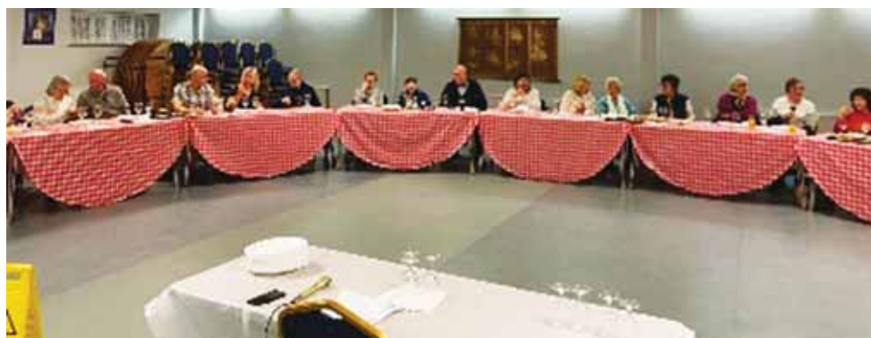
Cheese and Wine Tasting.