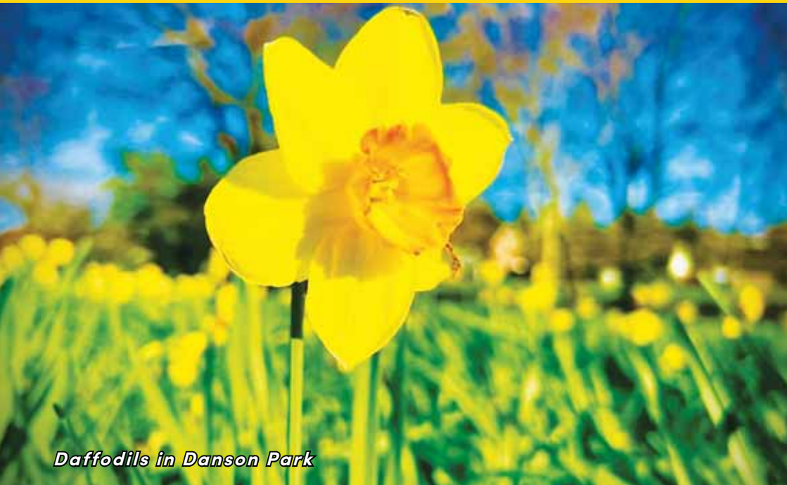
Daffodils in Danson Park