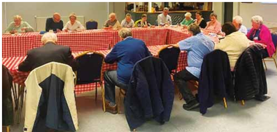
Soup and Roll.