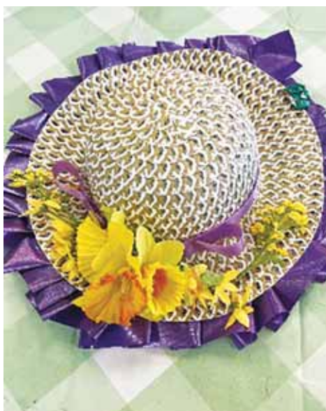
Easter Bonnet Event.