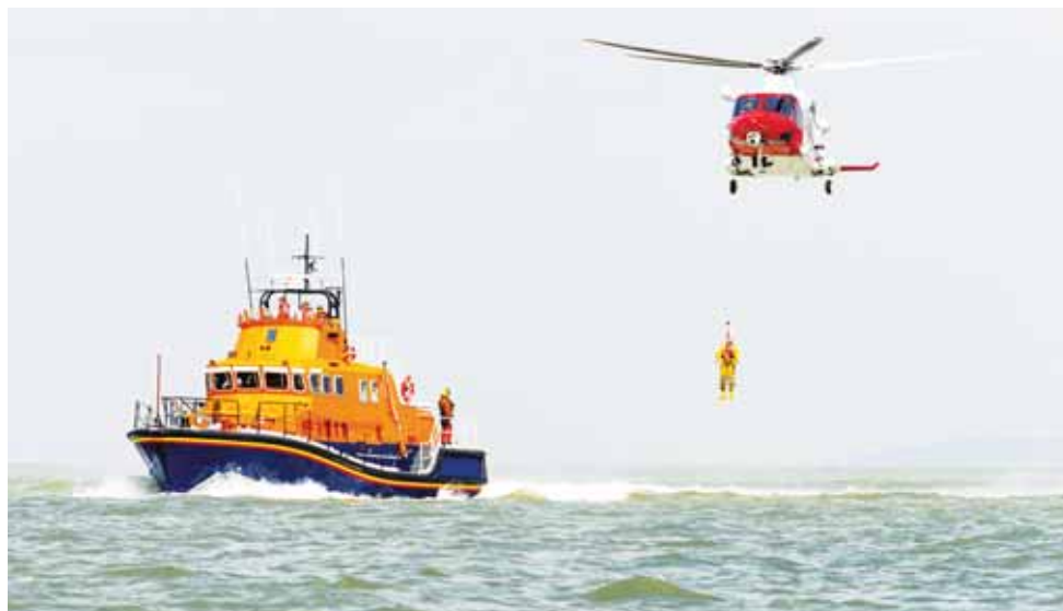
The Life-Saving Work of the RNLB – Wednesday 13 May