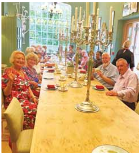
We had a wonderful day out to Tetbury, and a tour of the Kings gardens at Highgrove House, followed by an Afternoon Tea