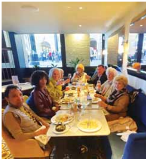
Another of our Friendship Month events was a lovely meal at Côte followed by Prosecco tasting at Prosecco House