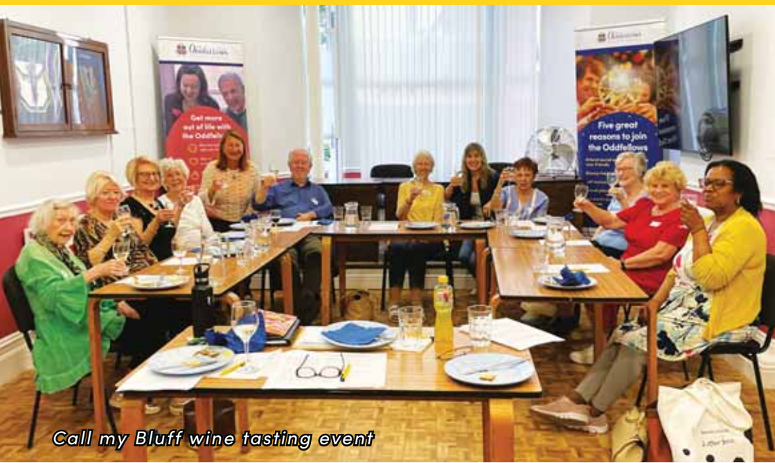
Call my Bluff wine tasting event