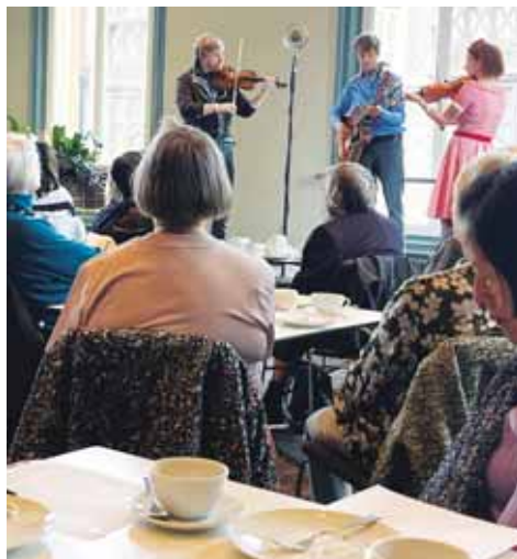
One of our Friendship Month events in September was a trip to The Afternoon Coffee Club at the Royal Albert Hall