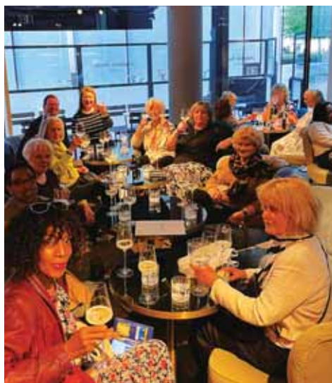
Prosecco tasting at Prosecco House