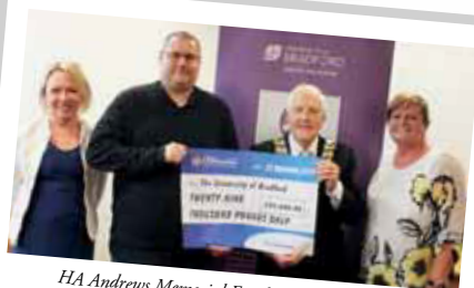
HA Andrews Memorial Fund presents University of Bradford with £29,000