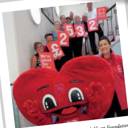
Oddfellows raise £2532 for the British Heart Foundation