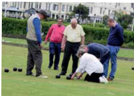
Oddfellows members enjoyed the annual bowls competition

With a jam-packed schedule mixing business with pleasure, AMC is a great opportunity for members to learn about the business side of the Society and our traditions, as well as meet and mingle with other Branches.