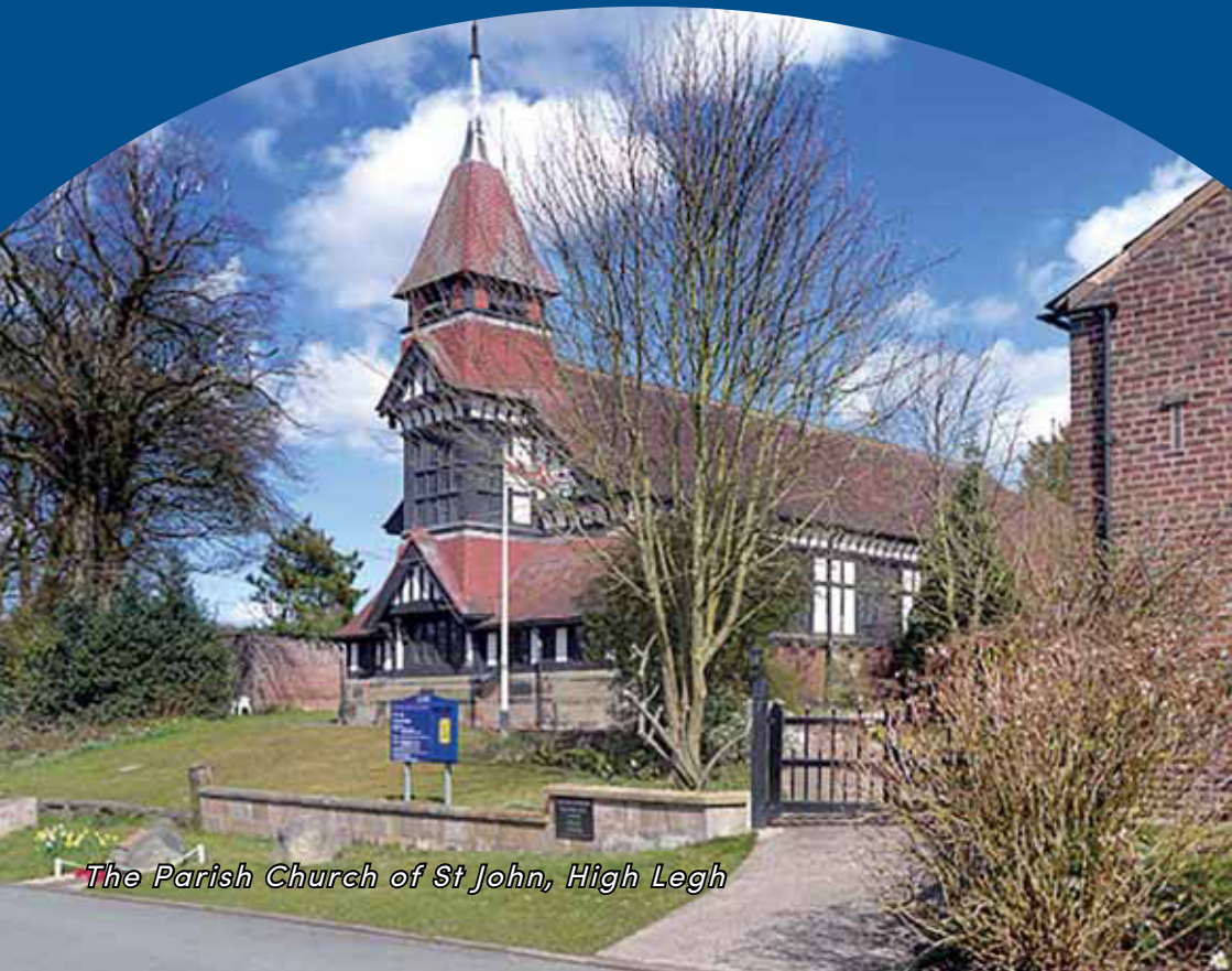
The Parish Church of St John, High Legh