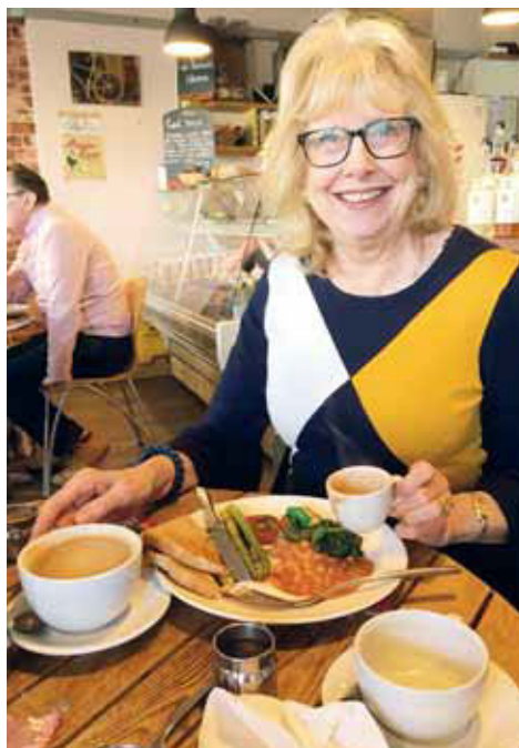
Coffee morning in Timperley