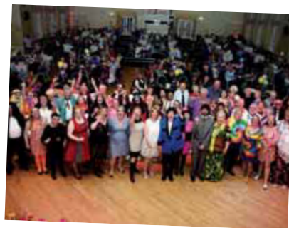
A 60s themed dance kicked off the celebrations at the Grand Master's Welcome Party