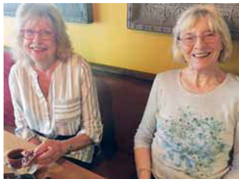
Coffee morning in Altrincham

Bacon butties and catching up with friends at Kings Café in Altrincham. Macclesfield Garden Centre café in May and the best scones. A delicious brunch and a chance to see the iconic Frank Sidebottom sculpture outside Garden and Grain in Timperley 'Frank will gaze on the Timperley sunset forever'.