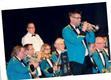
Oddfellows Brass gave a rousing public performance on Sunday