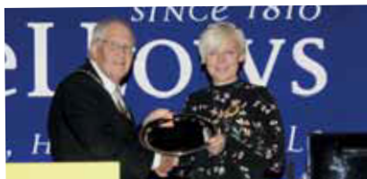
The "Refer a Friend" Award for the highest number of member advocates was awarded to Ormskirk and Southport Branch, with 31 members recruiting a new member in 2018