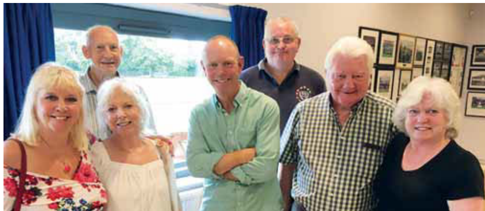
A celebration of life talk

for families to draw comfort from without reference to God, held at Timperley Sports Club.