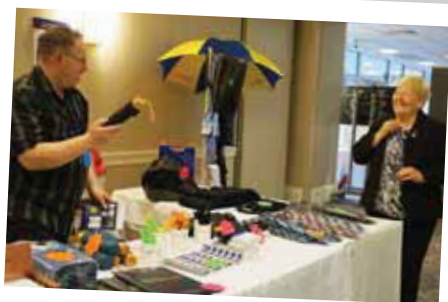
An array of Oddfellows merchandise was available for members to purchase

These include the Ken Hughes Silver Salver Award, won this year by Pride of Woolwich Branch, and the Lillian Ogden Recruitment trophy, awarded to Ormskirk and Southport Branch. Members can help their Branches to win awards too, as we also present the Refer a Friend Awards, to recognise Branches which have a great network of strong member advocates.