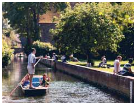
Relaxing and Historical Trip along the River Stour - Wednesday 13 May